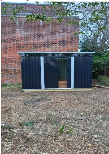
The new shed!